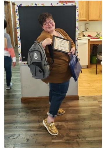
Positive Personality & 6 years of service