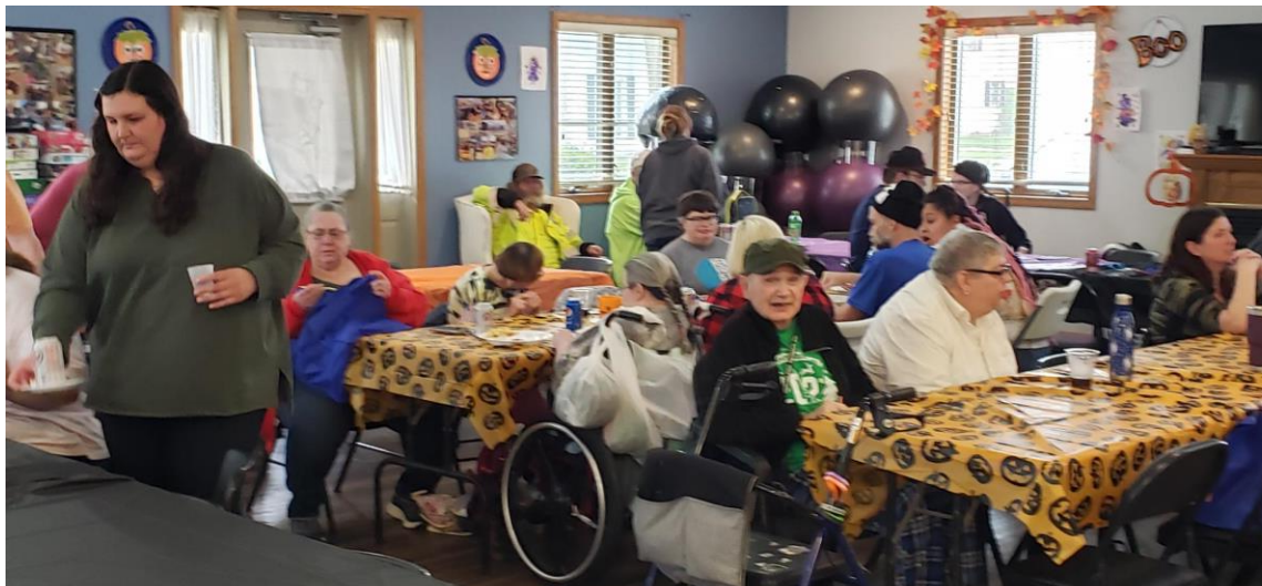
Appreciation dinner and Awards